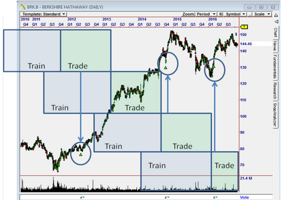
This chart illustrates the Incremental Training process.

These improvements are described on the Club web site, but one of the most important ones was “Incremental Training”, a concept that is illustrated to the right.